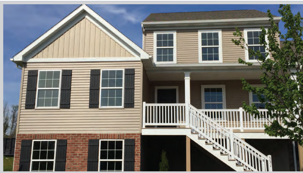
331 Wendover Way, Lancaster – Willow Bend Farm