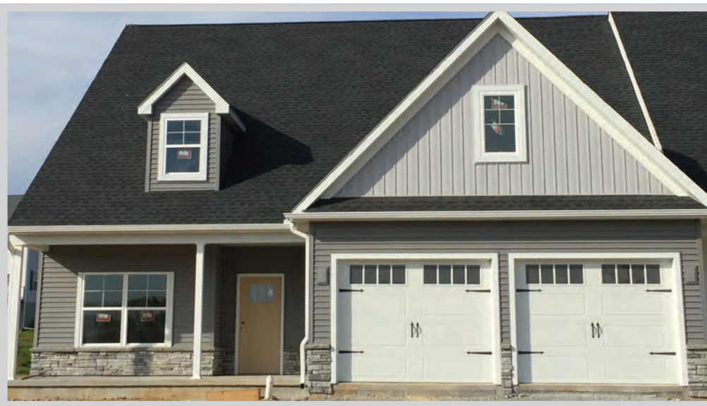
20 Wigeon Way, Elizabethtown – Villas at Featherton Community

the other is in our Willow Bend Farm Community in West Lampeter. Please be sure to stop in and see us during the Parade. We'd love for you to see these beautiful move-in ready homes and the lovely communities they are a part of.