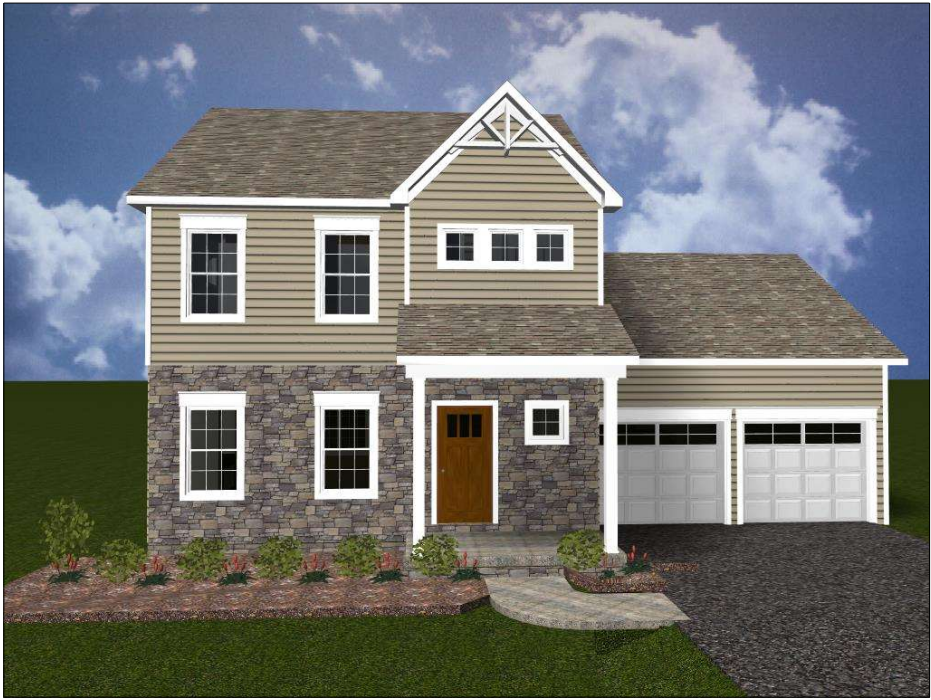
MODEL E FRONT ELEVATION

PRESENTATION DRAWINGS NOT FOR CONSTRUCTION